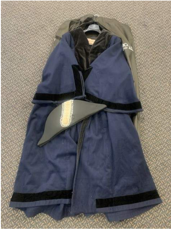
Mace Bearers robe, tricorn hat and white gloves