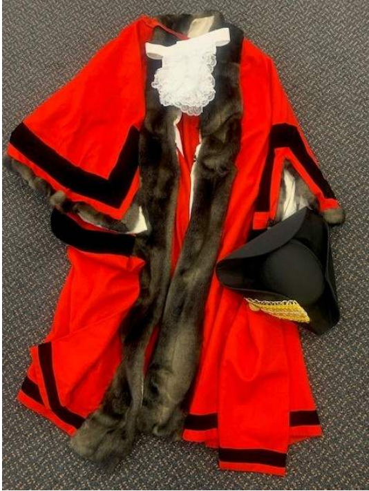
Town Clerk robe

Mayoral robe, tricorn hat (for female Mayors) and jabot